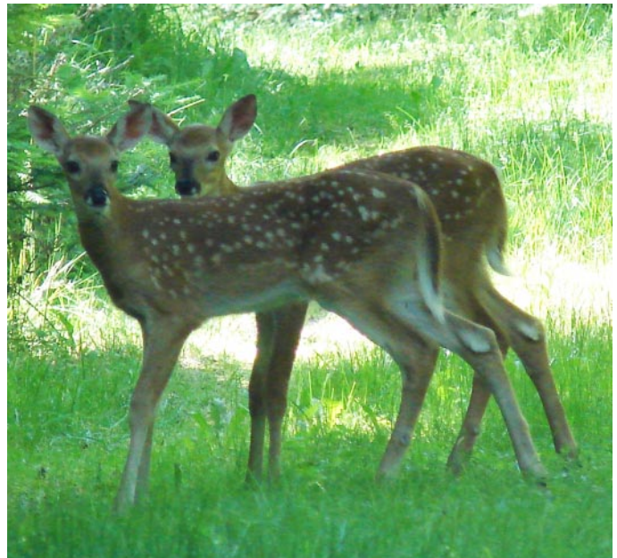
We share our neighborhood with much wildlife. Foxes seem to be abundant this year, deer always are, and an o'possum makes his appearance at the bird feeder.