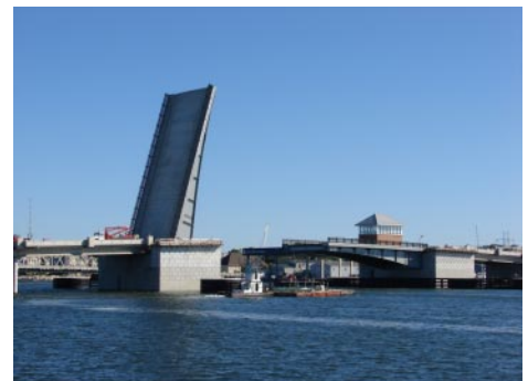
Downtown Sturgeon Bay had a serious facelift this Spring. Third Avenue was completely resurfaced and the sidewalks were restructured to be more pedestrian-friendly. Our new downtown drawbridge is well underway, with a scheduled opening later this year.