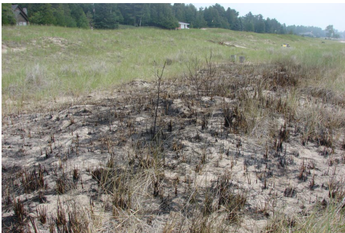
Not again! Fireworks are pretty, but are they worth the loss of your house? Careless use on the beach led to an unintended beach fire in front of 3960. Three firetrucks responded and it was put out by firemen with water backpacks.