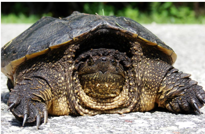
Why did the turtle cross the road? To get to the swamp on the other side, of course. This one snapped at anyone trying to help him across, but he made it by himself.