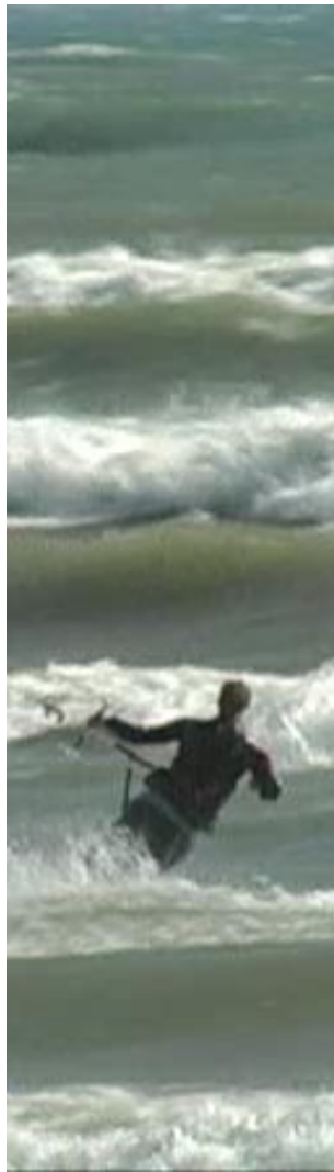
Windsurfing on Lake Michigan. On windy days, wind and board surfers come to our beaches from all over to provide us with some entertainment. Some say our waves are better than Kewaunee's.

The northern part of the drive is scheduled to be trimmed this summer