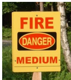
One of our new fire signs