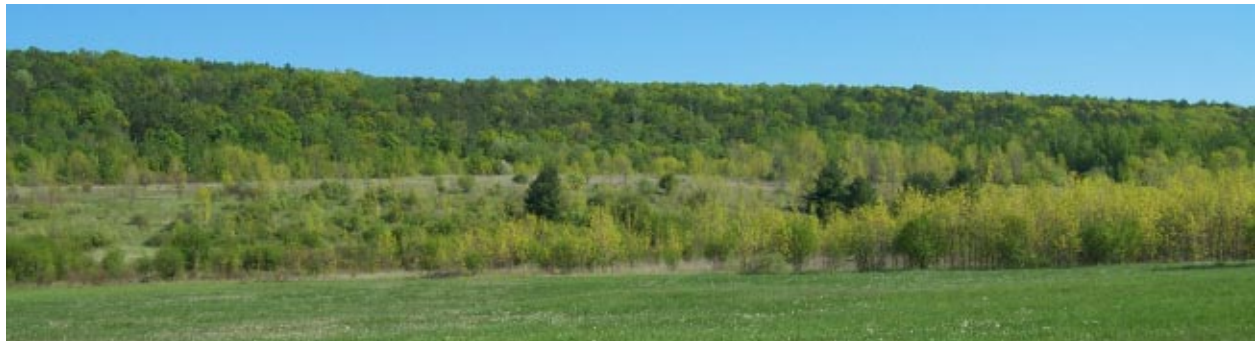
Niagara Escarpment off Bay Shore Drive

Latest records indicate that 450 acres are now protected by the DC Land Trust. In addition, the Nature Conservancy also has three tracts totaling 30 acres in the area that will be taken over shortly by the Door County Land Trust. On the south property referred to above, there is an information kiosk, more than one mile of hiking trails and wonderful vistas available to the public. Enjoy the beautiful nature of the area while at the same time remembering the thousands of years involved in its formation.